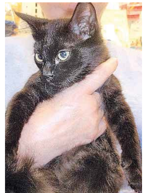
JellyBean is a great addition to a pet family.

Be kind. Save a life. Support animal rescue. •