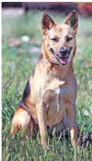
Jackie loves walks and family time.

Jackie is a beautiful 3 year old Shepherd/Lab mix. She was found as a stray and microchipped, but the people at the address she was registered to denied knowing her. So it's time for a new, better home for Jackie. Jackie is a wonderful dog who is 3 years old and weighs 68 pounds. She already knows how to sit and lay down on command. As she loves to go for walks and