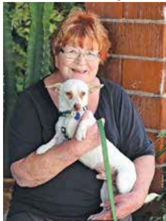
Radar is settling in and loves his new family and all the friends that he is meeting there!