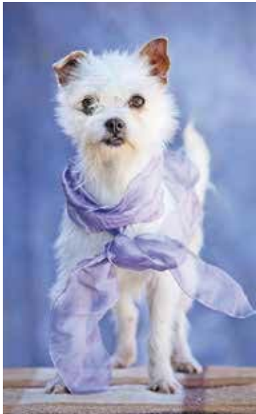
Lovey's favorite place is your lap.

Lovey is the sweetest dog ever! She was found as a stray in an empty lot with her two puppies; her owners were never located. Lovey is wonderful with all other dogs, loves all people and would like nothing better than to just hang out in your lap. She is very sweet, very smart and a very quick learner. With her cheerful personality, Lovey's tail is always wagging. She loves going for walks and is up for whatever outing you have planned. Lovey is spayed, current on vaccinations, microchipped, and fine with other dogs.