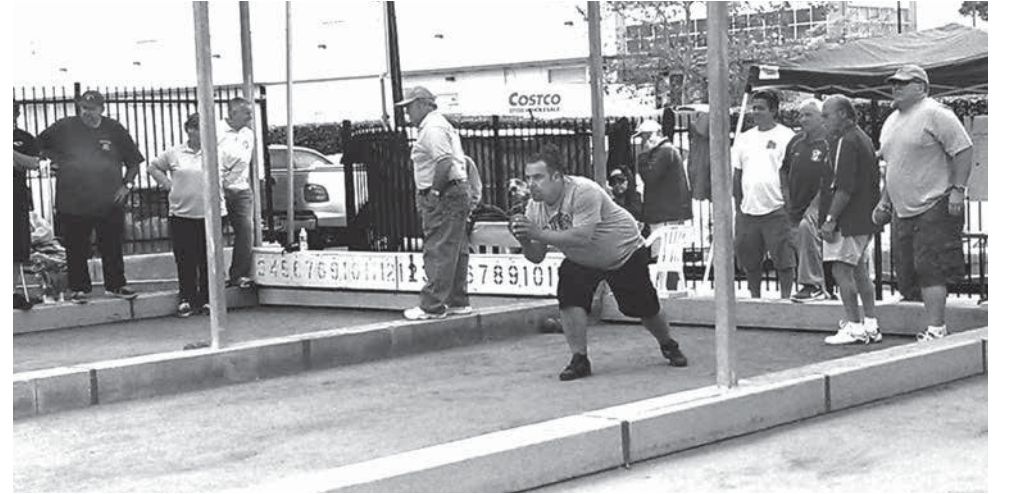
Players in the middle of a bocce match during the South Bay Bocce Courts project's Charity Tournament held in April.