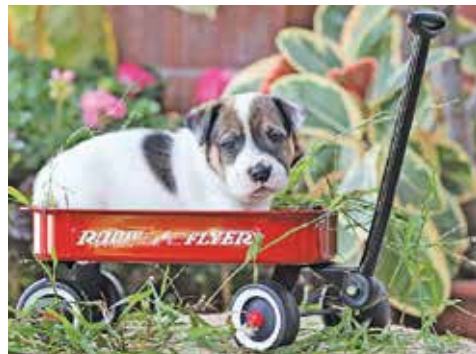
Spurs is a puppy who needs a family to love.

Spurs is one in a litter of 5 week old puppies we found being sold on the street corner: three boys and two girls. We DNA'd two puppies from this litter, so about the time they are 8 weeks old we will know what their breed is. We do know that they will be medium to large in size since they weigh