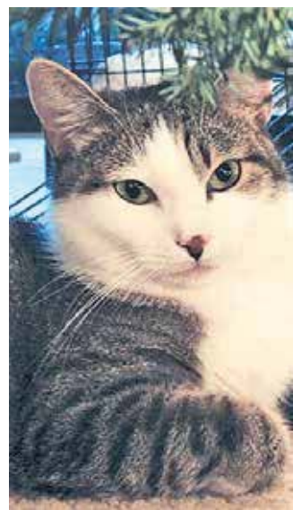
Arwen loves to be petted in a calm environment.

JellyBean is one very lucky kitten. He was discovered in a car engine, and his foster mom fished him out and cleaned him up. With his fluffy black coat, Jellybean is going out of his way to prove that black cats are lucky! And as if his handsome licorice coloring wasn't enough, he has developed hints of a white undercoat giving him a smoky appearance that is just too adorable for words. JellyBean absolutely loves other cats and even dogs. He is the perfect companion for a lonely cat as he is very high energy due to his youth. If you don't already have a kitty companion for him, Jellybean would love be adopted with Charleze, a gorgeous black female kitty who has adopted JellyBean as her baby or with fluffy grey kitten Constantine, who became his kitten companion upon his own rescue.